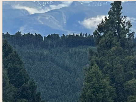
Snow on the high peaks