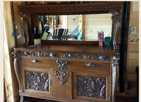
Genuine century-old antiques